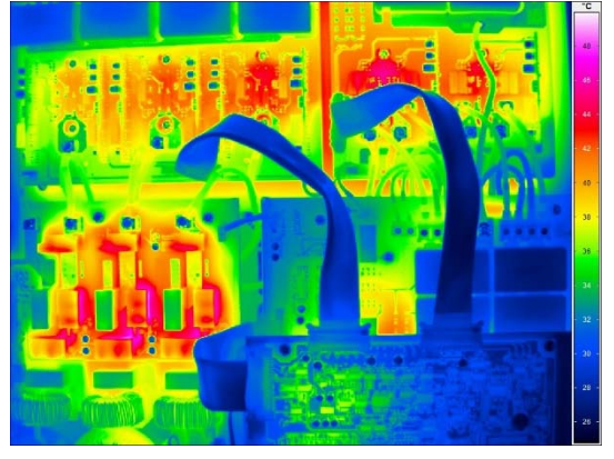
Inverter with loaded components to forecast their lifecycle

Another benefit for the ISIT derives from the precision calibration of the ImageIR® 8300 camera. The use of a set of additional side calibration curves compensates for drift and ensures a maximum measurement accuracy even under fluctuating measurement conditions. As with all thermographic testings of electronic components and circuits, measurements are influenced by the differing emissivity of the individual components. To overcome this situation, InfraTec offers an automated pixel wise emissivity correction routine directly in its control and analysis software IRBIS® 3. Using these tools precise statements can be made about temperature distributions and developments over time. With the time component of the heating playing an increasingly important role in the ever decreasing sizes of components, the ISIT is able to take advantage of the multi-kHz frame rates possible with the ImageIR® 8300.