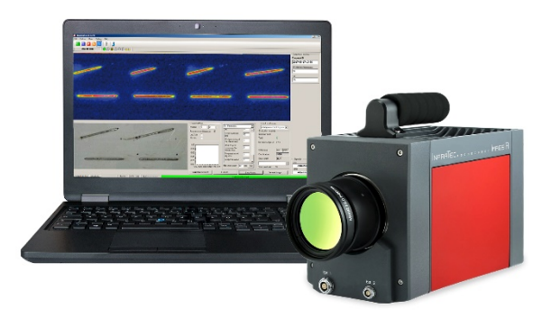
Abb. 3: High-End-Thermography Camera ImageIR® by InfraTec