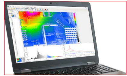
Thermographic software IRBIS® 3