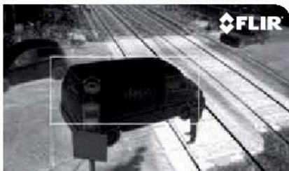
Level crossing obstacle detection

ThermiRail uses thermal imaging to detect people in between the different movements of trains and trams going through the detection field of view. Next to suppressing train movement, ThermiRail can also ignore small animals from its detection.